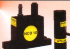
Pneumatic Ball / Roller / Linear Vibrator