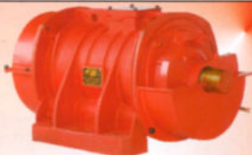
Unbalance Vibratory Motors