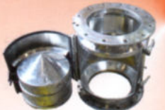
Super Intensity Rare Earth Tube Magnet - for Pipe Line