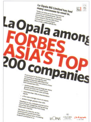
La Opala features in the Forbes list of Asia's 200 best companies with sales under $1 billion.

The impact of a multi-brand marketing strategy is said to have placed La Opala at the forefront of Indian glassmakers in terms of turnover according to latest industry statistics. With customers throughout the world,