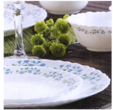
A diverse range of opal and lead crystal tableware is produced by La Opala.

His daughter-in-law also works for the company, co-ordinating La Opala's important product design and advertising initiatives. The glassmaker introduces 20-30 new products every year. This high turnover is considered necessary because consumers are constantly looking for something different. The company's distinctive brands are La Opala opalware, Solitaire