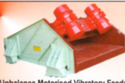
Unbalance Motorised Vibratory Feeder (Capacity 100Kg/Hr to 2000 TPH)