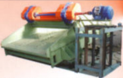
Exciter Driven Linear Motion Screen (Capacity 50TPH to 1500TPH)