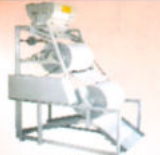
Drum Type Magnetic Separator (Single / Double / Triple Drum)