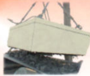
Suspension Magnet - Operating Height from (50mm to 1000mm)