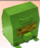
Bin-Vibrators for Hoppers / Silo / Chute