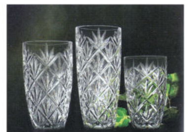
Hand-crafted 24% lead crystal items are manufactured.