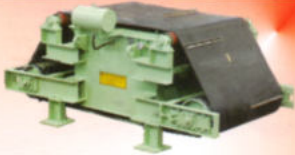
Over Band Magnetic Separator - (Operating Height from 50mm to 1000mm)