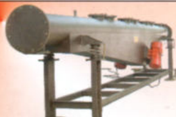
Vibratory Tube Feeder