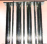
Hopper Magnetic Rod