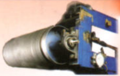
Magnetic Pulley - for Belt Width from (500mm to 2500mm)