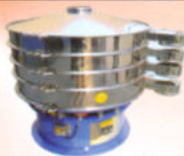
Circular Vibratory Screen (24 Inch Dia to 100 Inch Dia)